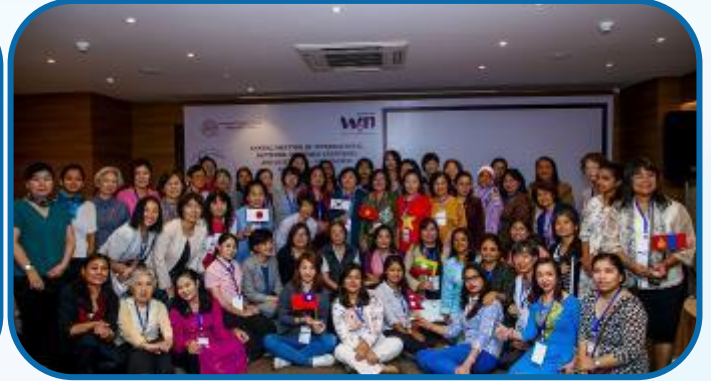
International Conference on Women in STEM