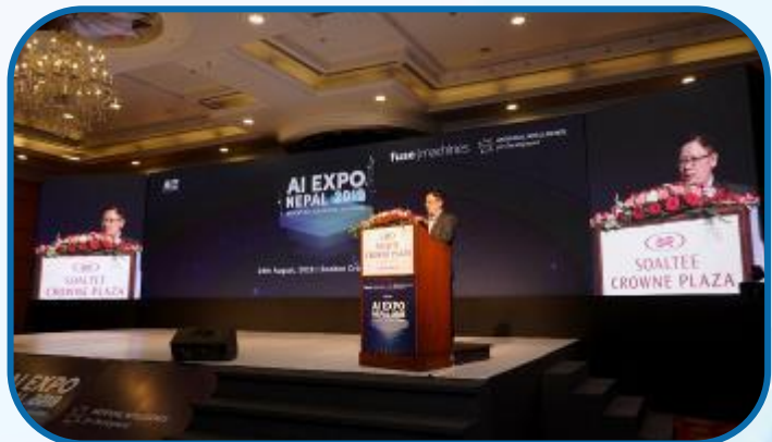
AI EXPO Nepal 2019