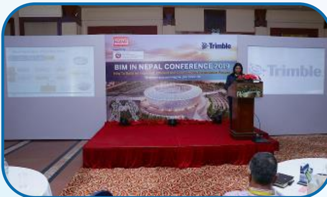
BIM in Nepal Conference