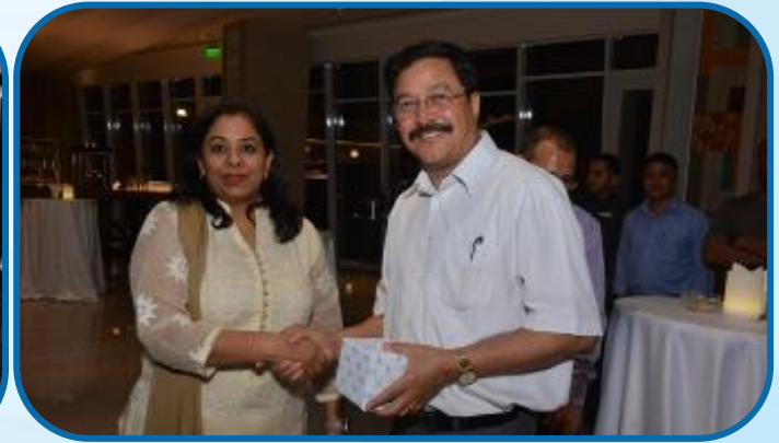
Nepal Telecom Cisco Day 2019