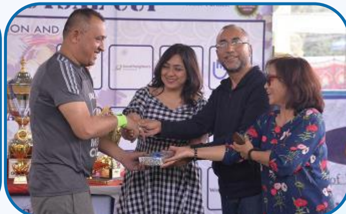
7th AIN Futsal Cup