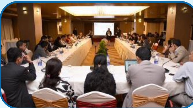
Public Private Partnership