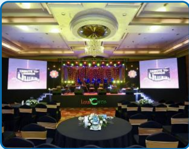
Grand Production of the Tribute to Legends

On 12th September 2019, Laxmi Cares organized a fund raiser gala dinner, "Tribute to the Legends", to raise funds for various social causes and also to commemorate 50 glorious years of musical journey of the legendary singer, Mr. Deep Shrestha. The grand celebration was one of a kind with its unique and marvelous ambiance where more than 350 attendees could lose themselves in the melodies from the legend himself while enjoying the delicious food.