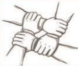
TEAM BUILDING WORKSHOP