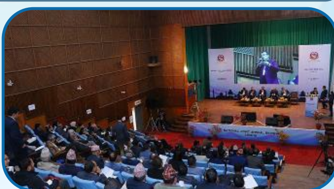
National Joint Annual Review