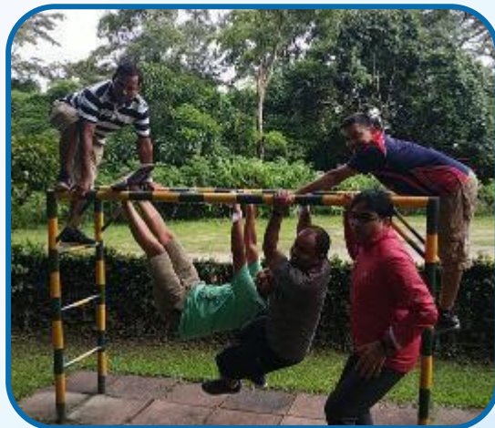
Participants completing the assigned task

W orld Vision International Nepal is a Christian relief, development and advocacy organization dedicated to work with children and families of the vulnerable communities to overcome poverty and injustice. Since 2001, World Vision International (WVI) Nepal has been working for the well-being of children, partnering with communities, government bodies, private sectors and NGOs at the local level in some of the most remote areas in different districts of Nepal.