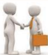
PROFESSIONAL SKILL BUILDING