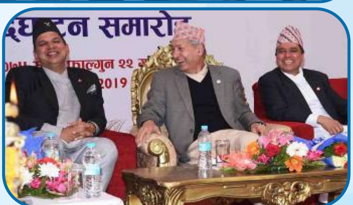
Nepal Infrastructure Bank - Grand Inauguration