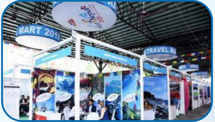
Himalayan Travel Mart 2019