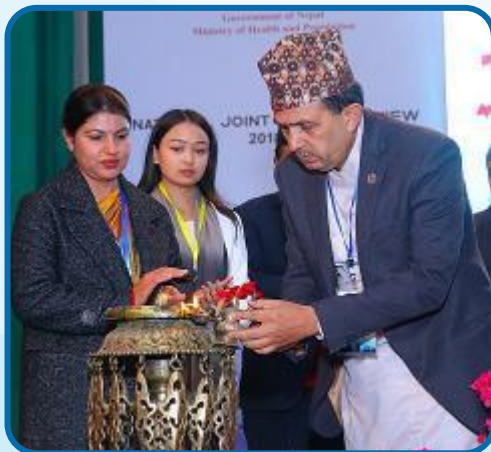
Hon. Minister of Health and Population Mr. Bhanubhakta Dhakal inaugurating the event

To jointly review the NHSS annual implementation plan, the National Joint Annual Review (NJAR) of the health sector 2019 (2076 BS) was organized by the Government of Nepal, Ministry of Health and Population (MoHP) and external development partners (EDPs) jointly on 4th and 5th December 2019.