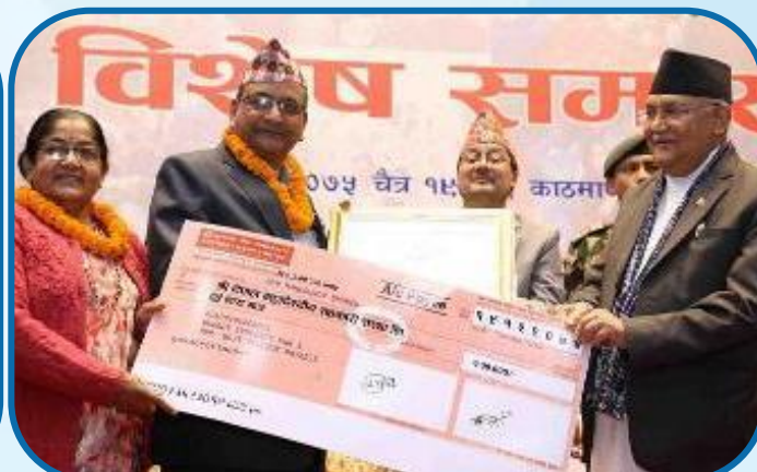
62 th National Co-operative Day