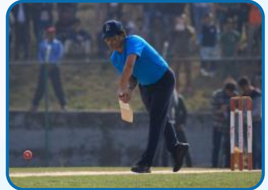
Cricket Legend Mr. Sachin Tendulkar in action

United Nations Convention on the Rights of the Child (UNCRC) is a human rights treaty having 54 articles which covers all aspects of a child's life and sets out the civil, political, economic, social and cultural rights that all children everywhere are entitled to.