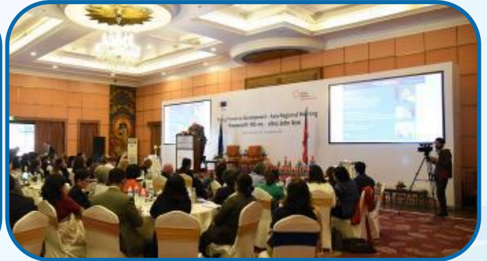
Policy Forum on Development