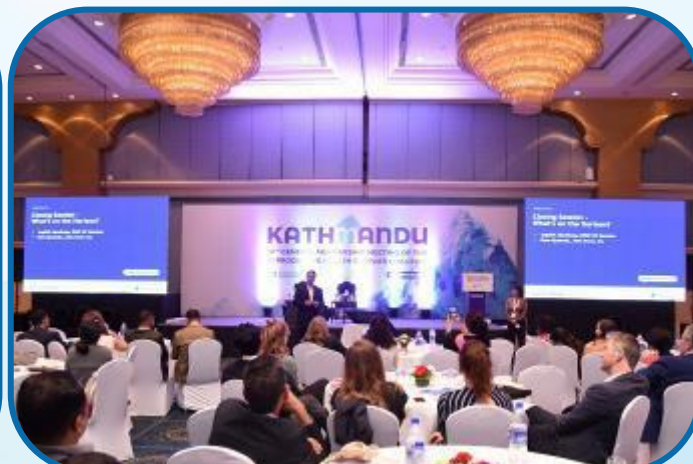
19 th General Meeting - RHSC