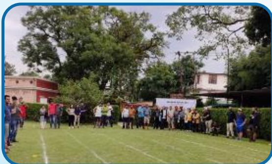
Participants getting ready for the three legged race