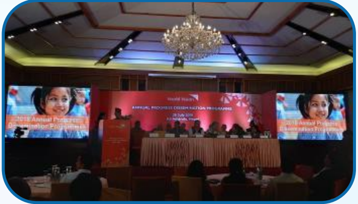
Annual Progress Dissemination Programme