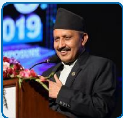
Hon'ble Minister for Education, Science, and Technology, Mr. Giriraj Mani Pokharel

With the objective to bring all the AI enthusiasts and stakeholders together, Fusemachines together with AID, organized the country's first ever AI Expo. The event, AI Expo 2019, was the first and the biggest expo targeting Artificial Intelligence with more than 2000 attendees. Honorable Minister for Education, Science, and Technology, Giriraj Mani Pokharel was present as the distinguished Chief Guest of the event.