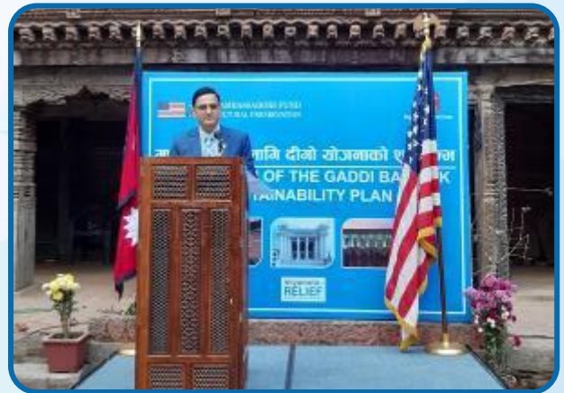
Hon'ble Minister for Culture, Tourism, and Civil Aviation Mr. Yogesh Bhattarai

Since 1908 Gaddi Baithak Palace has been a hallmark of the square, but this is a historic first. The Palace has never before been opened for the general public. Guided tours of the main hall will be available and the ground floor of the Palace will house a museum. The museum, which will open later this year, features rare artifacts of Nepalese history and culture. Pre-registration at a designated entry check-point is required to participate in the guided tours. These tours will allow both Nepalese and foreign tourists to enjoy Gaddi Baithak just in time for Visit Nepal 2020.