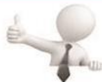
ORGANIZATIONAL BEHAVIOR TRAINING