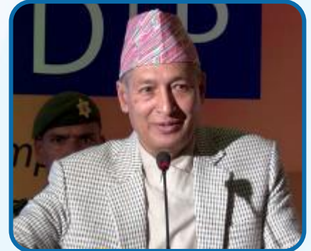
Hon'ble Finance Minister Mr. Yuba Raj Khatiwada

The Human Development Report 2019 is the continuation of a series of annual reports published by UNDP, comparing countries based on their education level, health status, per capita income and so on. This year's report is the first of a new generation of HDRs which focused on inequality and provided a comprehensive analysis using framework that goes beyond income and averages.