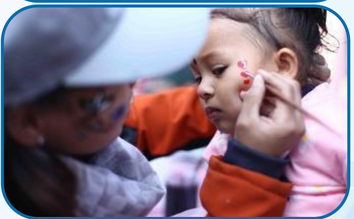
Good Neighbors International Nepal - Family Day Out 2019