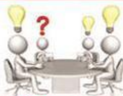
COMMUNICATION & PERSONALITY DEVELOPMENT TRAINING