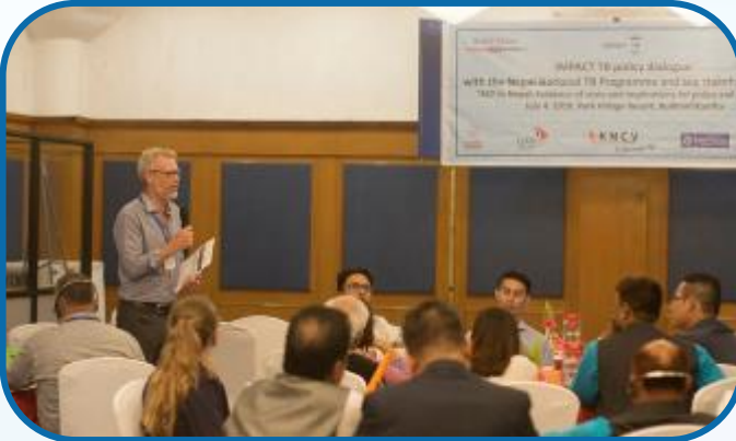
Impact TB Policy Consortium Meeting