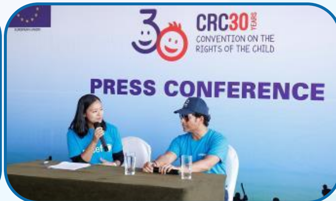
UNICEF -Convention on the Rights of the Child