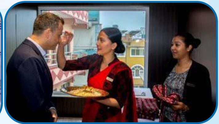
JCUB Partners Meet 2019