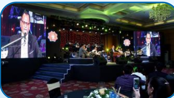
Laxmi Cares- Tribute to the Legends