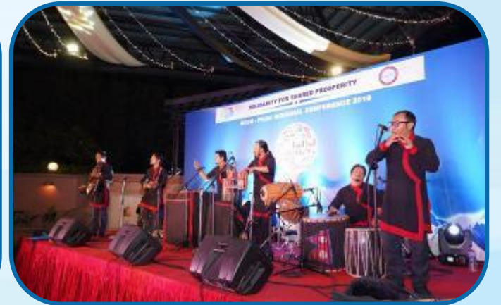
HCC-N FICAC Regional Conference