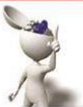
STRESS MANAGEMENT WORKSHOP