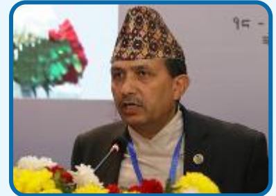
Hon. Minister of Health and Population Mr. Bhanubhakta Dhakal

N epal Health Sector Support Programme (NHSSP) is funded by UK Aid from the UK government. It is designed to support the goals of the National Health Sector Strategy and is focused on enhancing the capacity of the Ministry of Health and Population (MoHP) to build a resilient health system to provide quality health services for all.