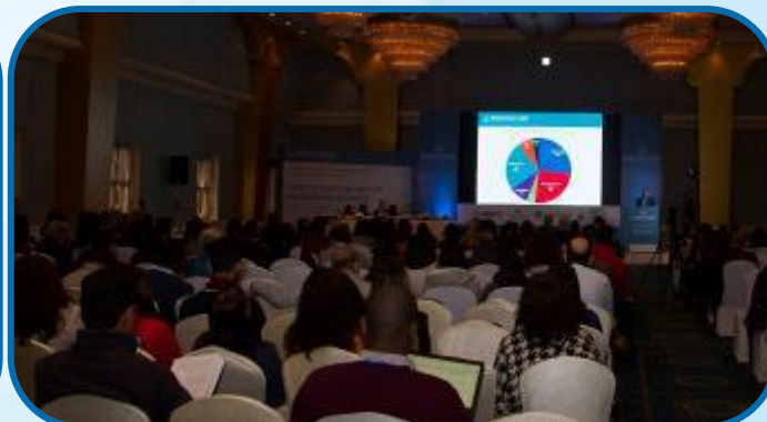
7th Annual Scientific Symposium in Nepal