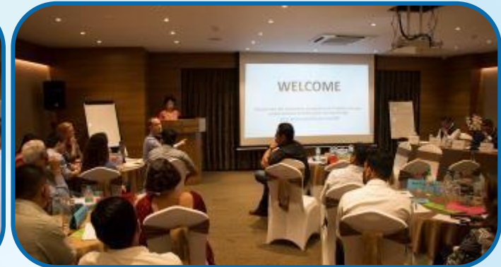
BNMT Workshop on TB affected household