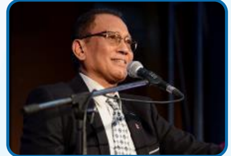
Legendary Singer Mr. Deep Shrestha

L axmi Cares is a social initiative by the Employees of Laxmi Bank, a Category 'A' financial institution. Laxmi Bank is technologically driven progressive bank with strong risk and corporate governance foundations, known for their innovation and many "firsts" in the Nepalese financial market. Laxmi Bank has one of the best asset qualities among all financial institutions in the country.